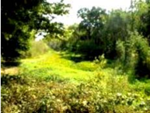
A scene on Mile 3-4 of the American River Parkway